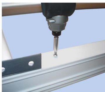
Position truss head