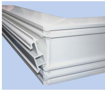
Insert the adapter