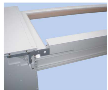
Slide the guide rail under the roller shutter box