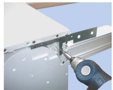
Screw on the handles