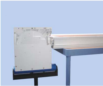
Put roller shutter box on trestles