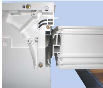
Raise the frame