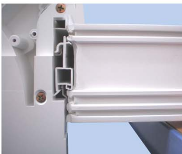
Press the frame adapter into the base profile