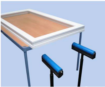
Put the frame the table