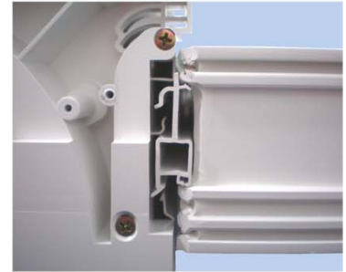
Insert the frame into the base profile